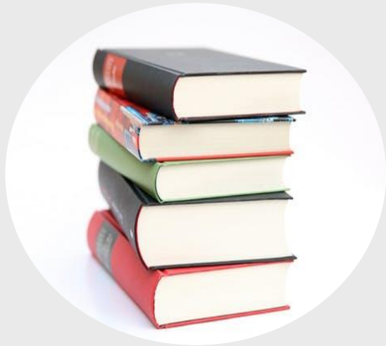
ICS Scholarships Project