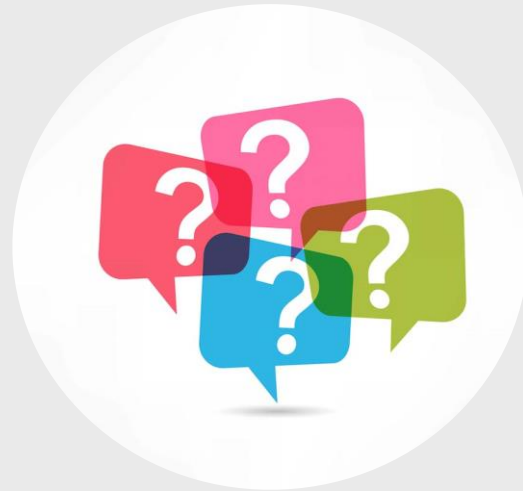
Annual WISTA Membership Survey