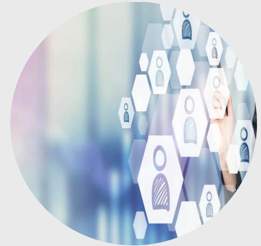
Gather data for women in the maritime cluster internationally